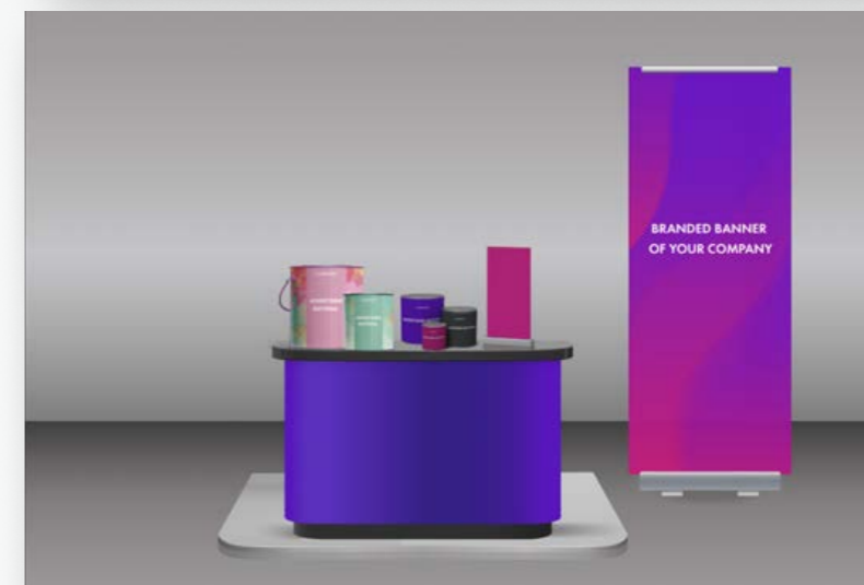
Table-top (mini-booth) at the registration / coffee-breaks (networking) area in conference foyer

Choose an package and email us to: info@must-have.events